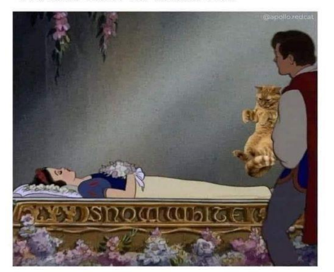
"I know how to wake her"