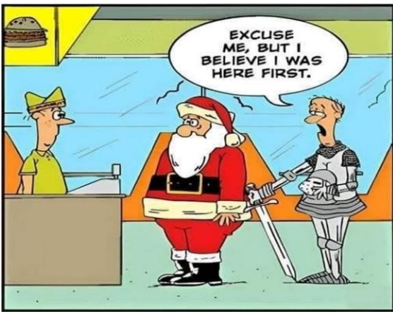
TWAS THE KNIGHT BEFORE CHRISTMAS...

When you're too cheap to buy Christmas decorations