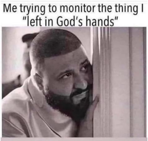
hey, it's me again just checking up on the status

When your body is a temple but you wanna make it a megachurch